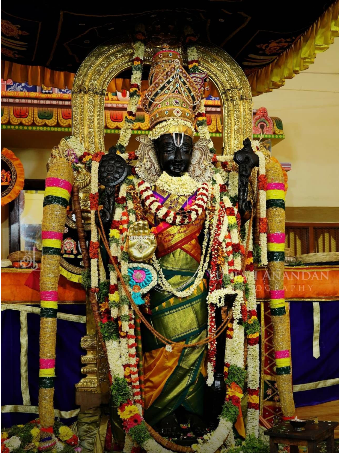
Sri Atthi Varadar – Kanchipuram