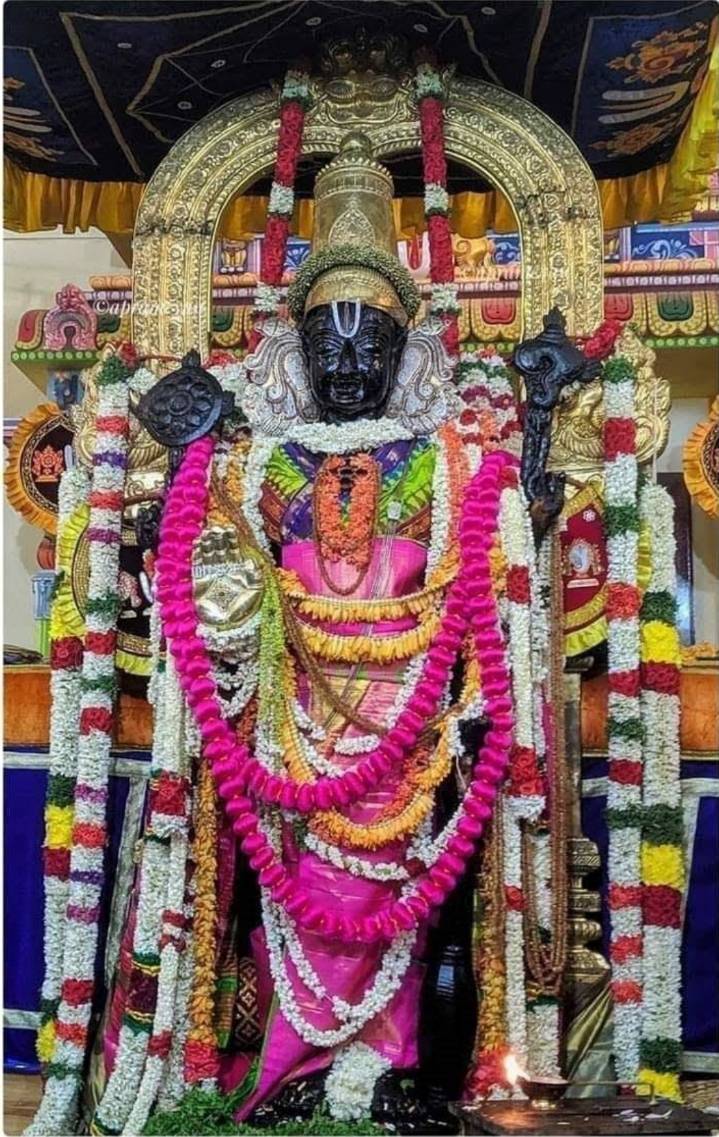
SrI Atthi Varadar - Kanchipuram