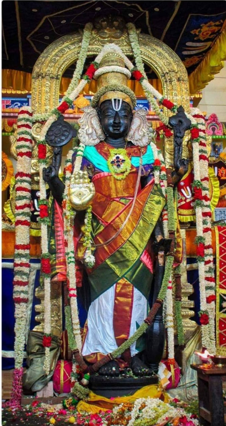
SrI Atthi Varadar - Kanchipuram