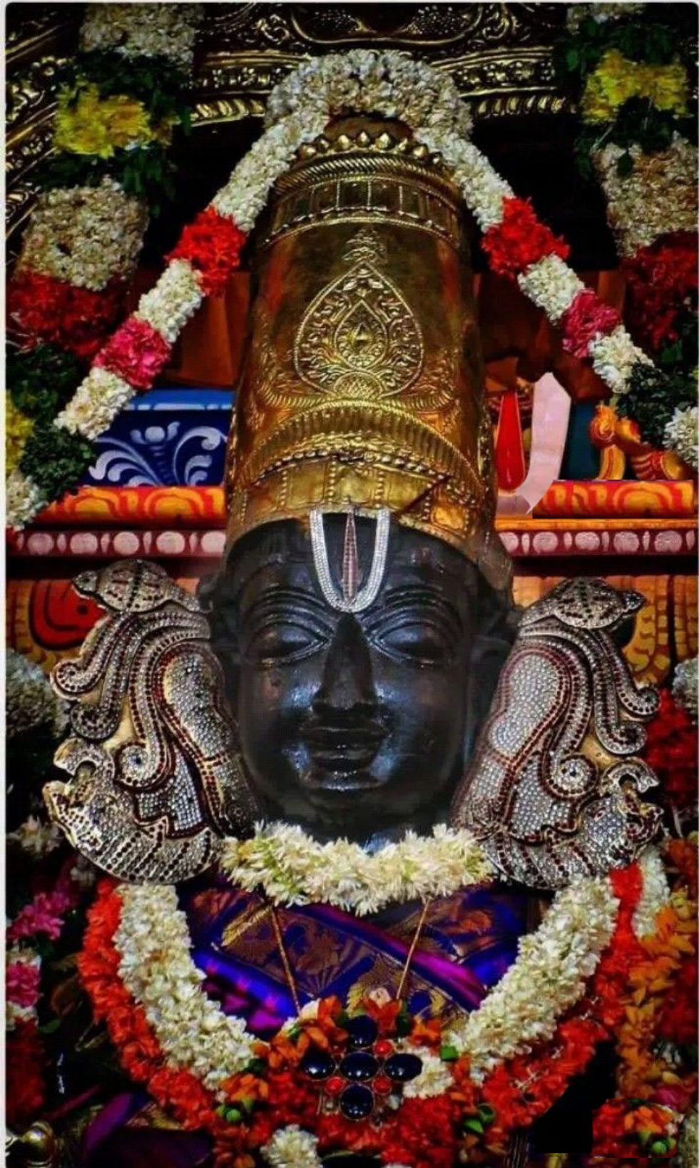
SrI Atthi Varadar - Kanchipuram