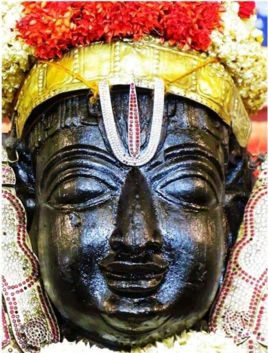
SrI Atthi Varadar tirumukham